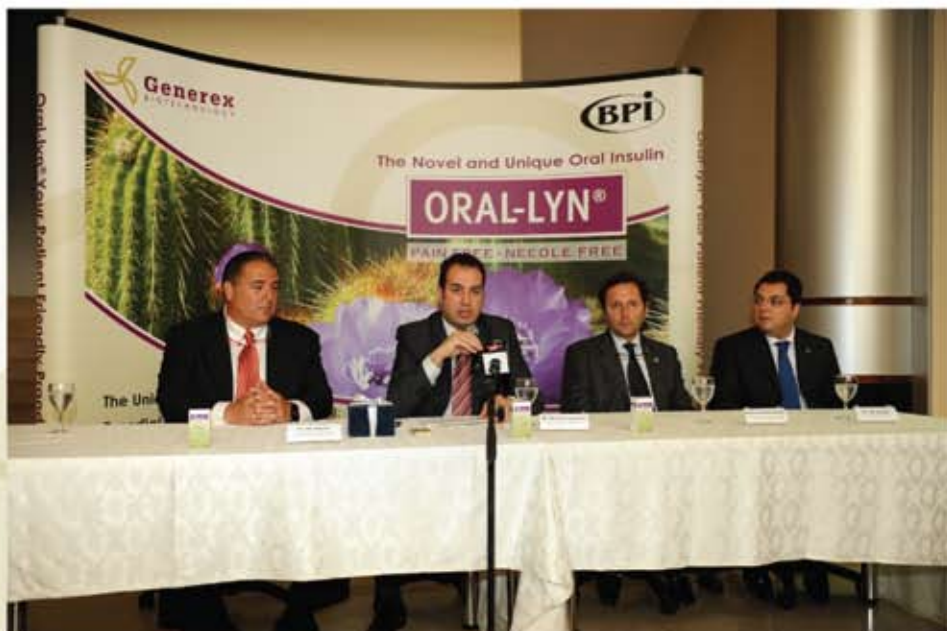
Press Conference at BPI: