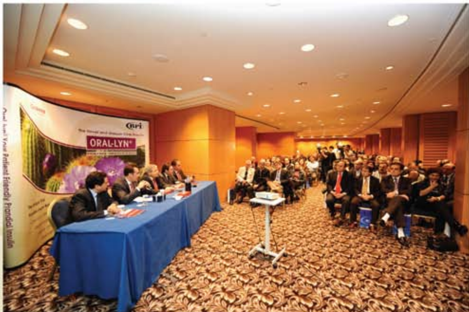
ORAL-LYN Symposium at Le Royal