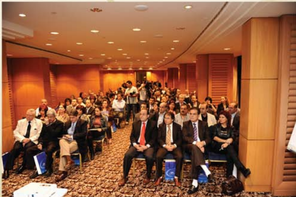
ORAL-LYN Symposium at Le Royal