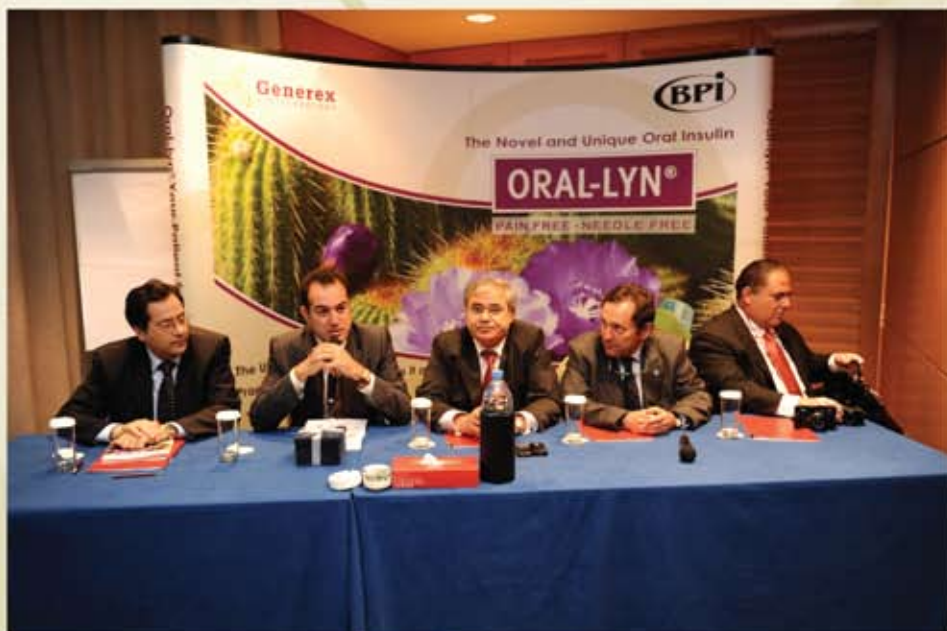
ORAL-LYN Symposium at Le Royal Hotel: